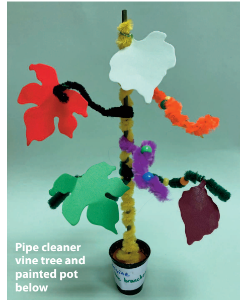
Pipe cleaner vine tree and painted pot below

In February we moved to the new testament where in John 15: 3 Jesus said: "I am the vine and you are the branches whoever remains in me will bear lots of fruit." The roots of the vine that are in the ground represent Jesus - God's Son. The branches represent us. Branches are connected to the vine so we can be connected in friendship with Jesus, but branches can become disconnected in a storm. In the storms of life we can become disconnected in our friendship with Jesus, but by saying sorry and saying yes to Jesus - God's Son, we are special, loved, accepted and forgiven. If we remain friends with Jesus we will bear lots of fruit which gives us confidence in knowing Jesus as a friend. Our crafts this month were pipe cleaner vine trees, planting bulbs and painting pots, fruit flans which included grapes of course! and bead bracelets to remind us to stay connected to God.