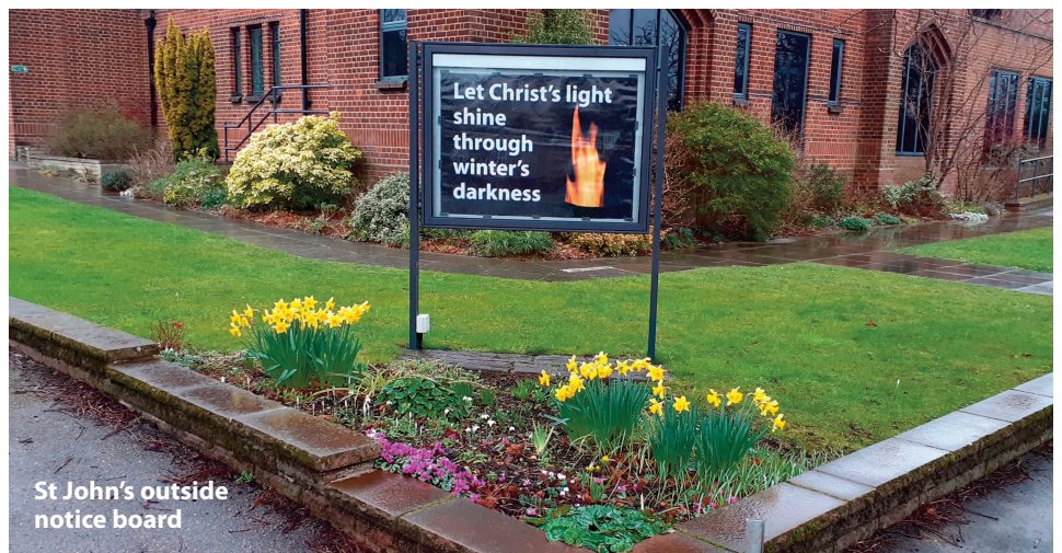
St John's outside notice board

Blessings to you all - St John's Leadership Team