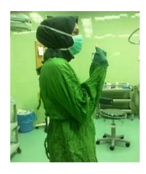
We thank you for the doctors and nurses helping patients at this difficult time.