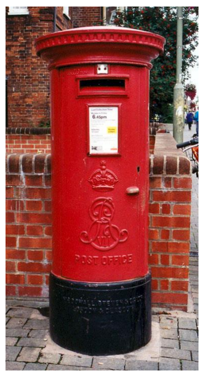
We pray for Postal Workers and others delivering parcels, news and goods.

We remember with thanks the Fire and Rescue service: its bravery and dedication, saving lives and property.